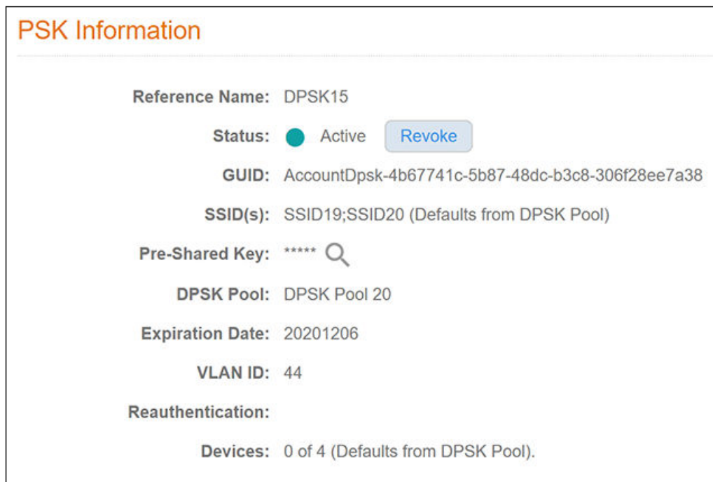
FIGURE 3 DPSK15 Information in UI After API PUT Call

You can go to the UI to confirm that the DPSK was edited correctly. The values should match those in the Response body from the PUT. For example, you can see that the SSID list no longer has any restrictions, and that the VLAN ID has been changed to 44.